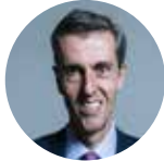
Andrew Selous Conservative MP

We know that the restorative community found in the Church is crucial in helping people make positive changes to their lives. We'll continue to invest in renewing our group service materials so that these tools are excellent resources for churches to use in their communities.