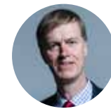
Stephen Timms Labour MP

This fresh expression of our vision has been developed at a time when there are new opportunities for CAP to inspire and equip individuals, churches, industry and government to become part of the practical and spiritual change we need in society.